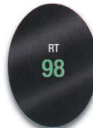
(1.25X Actual size)